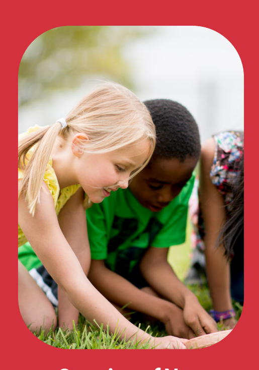
Overview of New Independent Schools Inspection Framework 2023