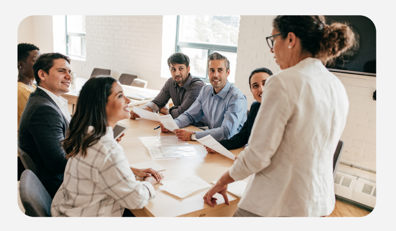
LEADERSHIP & MANAGEMENT SENIOR LEADERS