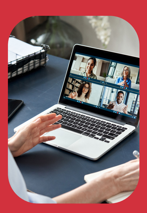
Headteacher and Subject Leader Briefings