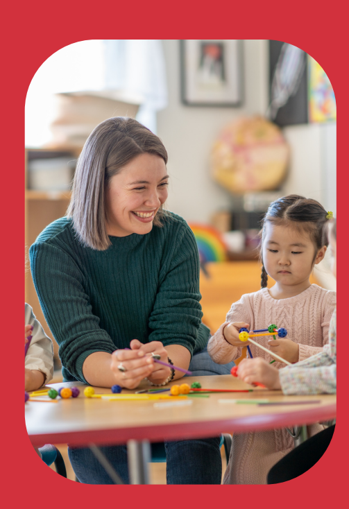
Subject Report Briefings