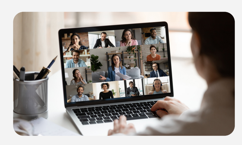
ECM TERMLY BRIEFINGS