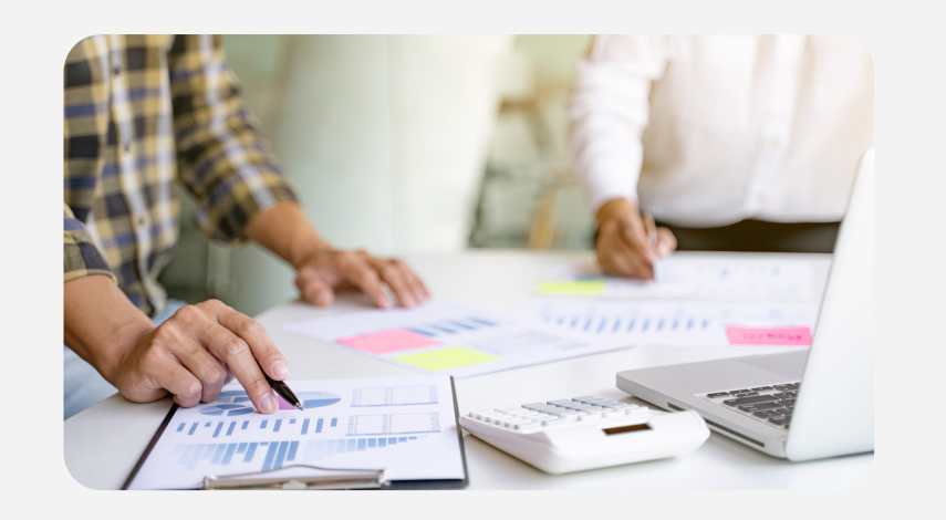
INSPECTION AND OFSTED