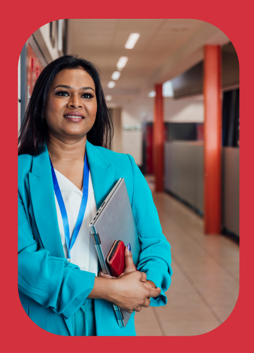
From inspection call to inspection report - being prepared