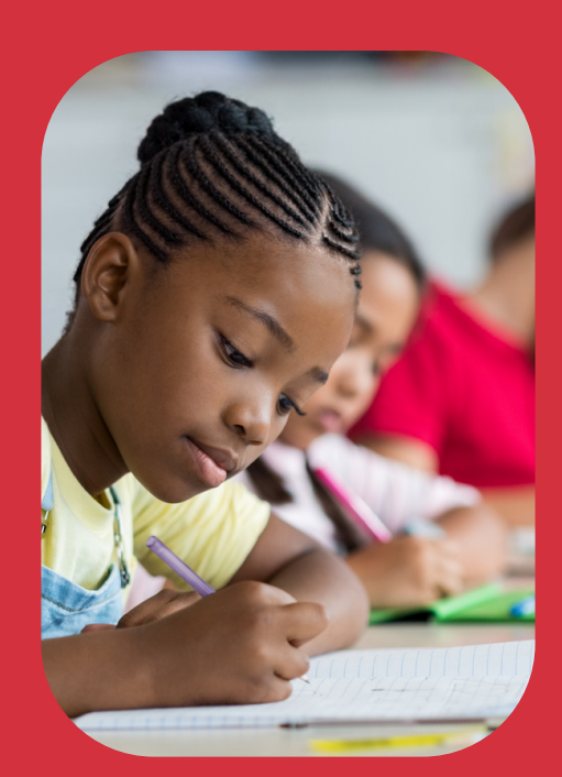
Improving Writing stamina - Primary